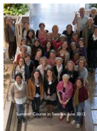
GEDS' Summer Institute in Jönköping, Sweden, 2012.